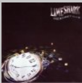
Lime Shark -The Money Clock